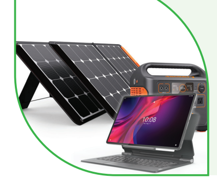
Solar charging and system for learners living outside the coverage of our KPLC national grid